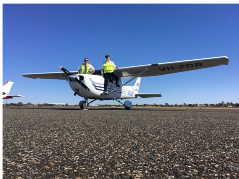
Self timers are a must for the stop over at Kalgoorlie