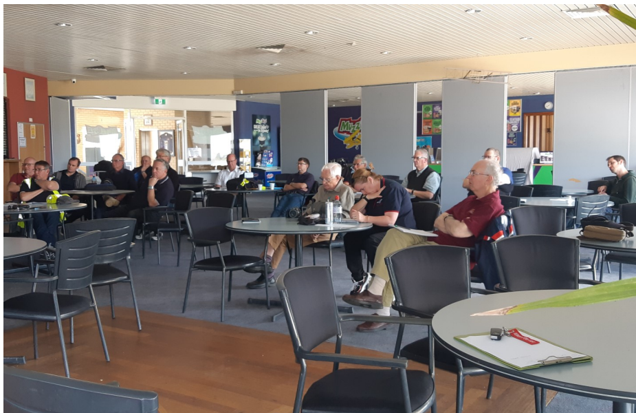
WALAC information session with competition explanations

This is a commemorative flight to celebrate the Lancaster that is currently housed at the Bullcreek Museum. After a quick briefing we will set off on a journey around the "Dams" in the hills area. This is a flight for about an hour at most and is usually from around 3pm on Saturday 5 th December 2020.