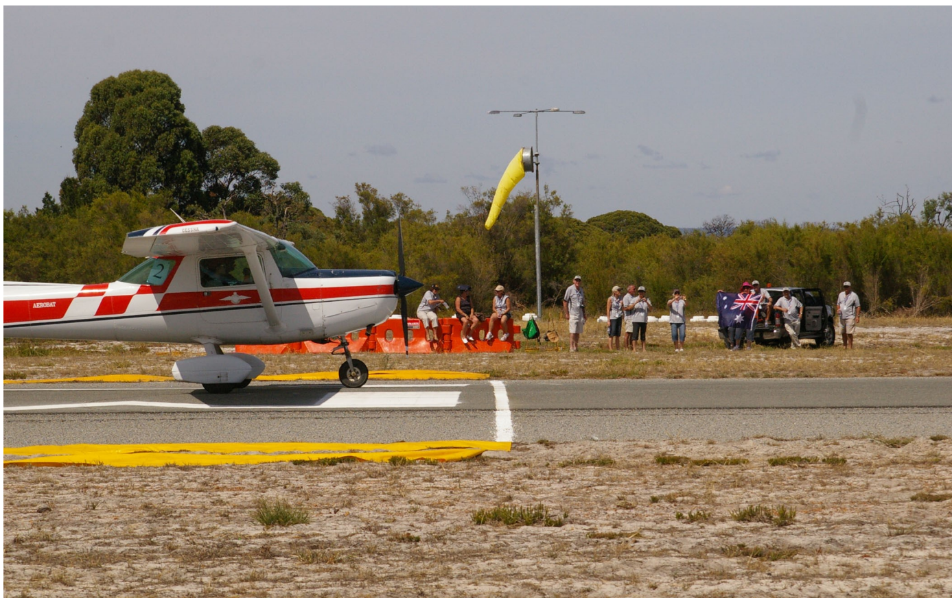
Club Comp - spot Landing at Murray field

With Club Flying on the rise, now's the perfect time to participate with our upcoming events. The Western Australian Light Aircraft Championships are on in the first week of November and the Annual Greg Hill competition is just around the corner. Go check out our Members' Calendar on the back page!