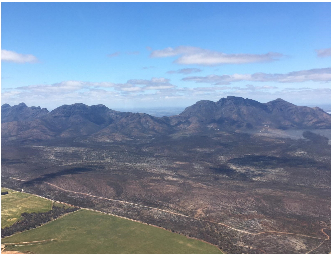
Bluff Knoll and the Stirling Ranges, Just one of the memorable landmarks from their Away Trip