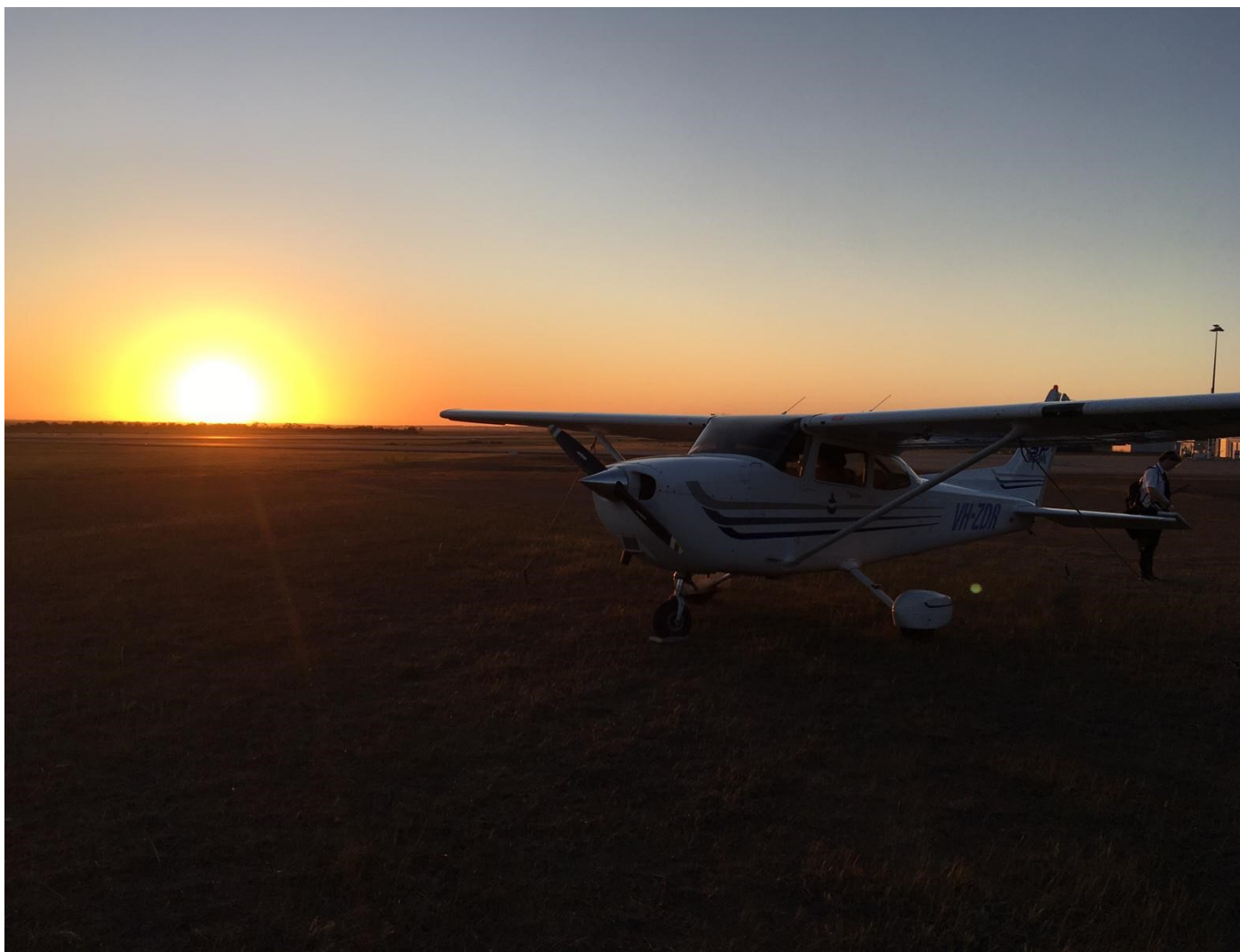
ZDR parked up for the night with the sun setting behind after a long day flying on the boys' away trip