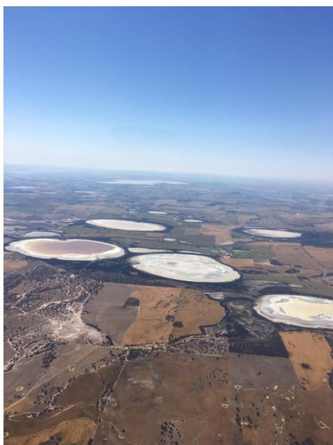
Salt Lakes of the Western Australian Wheat Belt

The boys set about with navigation and meteorology planning with guidance from their instructors a few weeks before their intended departure date. This allowed for questions to be an-