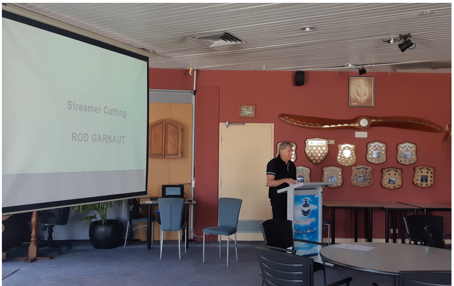
WALAC Information session, covering all the competition types and the appropriate scoring.

But I'm getting ahead of myself- November 15 th there will be a "Dawn Raid" to Northam, known as the gateway to the wheatbelt, the members of this long established club will welcome us with