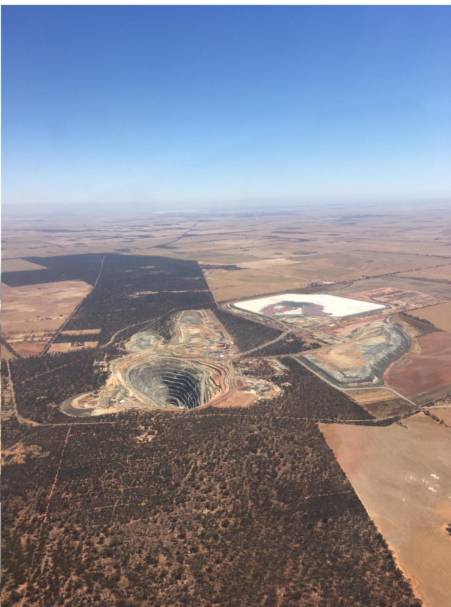
The Super Pit, the famous Kalgoorlie open pit gold mine located on the South Eastern Edge of Kalgoorlie in Western Australia.