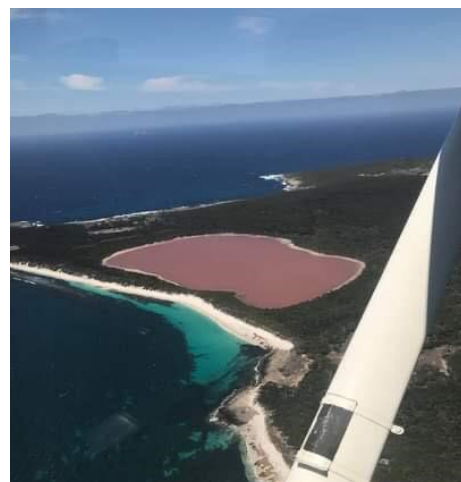
Day Trip out to the Pink Lake

With the enjoyment and success of this away trip the Royal Aero Club and Western Aviation College of Western Australia hopes that more of our students and pilots partake in flights away from their 'backyard'. The challenges that pilots face on these trips away from the 'safety' of the training area and instructors are memorable and rewarding.