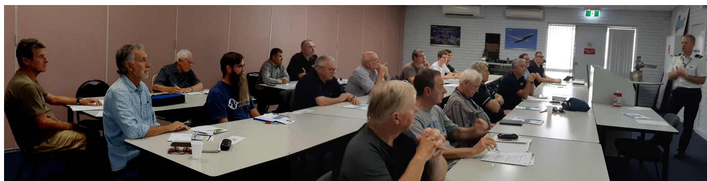
The Free Member's Rottneest RPL & ARF Seminar Snday March 15 was well attended, numbers for Rotto Bun Run are looking great this year

Next month: Murrayfield competition will be right hand seat circuit. Fly a circuit from your instructor's perspective, Sunday 5th of April.