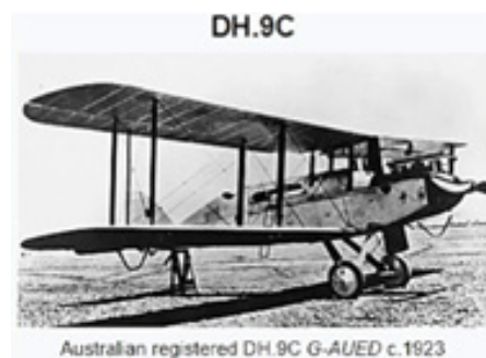
Australian registered DH.9C G-AUED c.1923

De Havilland was a family company with brothers Geoffrey and Hereward's inspirational leadership. Just some of their early aircraft included DH Biplane 1 and 2, SE2, FE2, BE2, DH2 Fighter, DH4 Bomber, DH5 Fighter, DH6 Trainer, DH9 Bomber and DH10 Amiens Bomber.